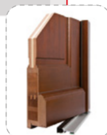
Retro 68 door profile

New: Entrance doors, profile 78, with the aluminum cladding are our new, exclusive product for the most demanding customer.