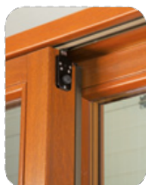
Sliding element of sliding system