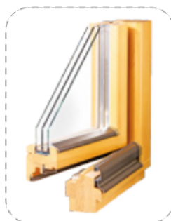
Eco LUX 78 section

coefficient of glass Ug = 1.10 coefficient Uw = 1.20