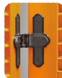
Broken hinge of folding shutters