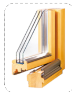
Passiv LUX 92 section

coefficient of glass Ug = 0.50 coefficient Uw = 0.96