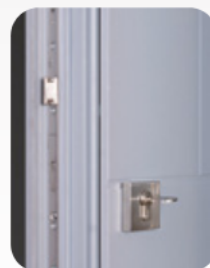
Alu cladding door

The aluminum coverings reduce heat penetration by ca. 20%, on the average.