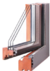
Gemini Linear section

A wide range of the aluminum cover systems such as Soft Line, Classic, Linear, Retro or Quadrat, as well as the colour diversity enable to fit in practically any architecture, while Renoline system can be used for window renovation.