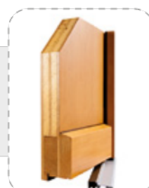
78 door profile

Our entrance doors are safe and aesthetically pleasing, they are each house's showpiece and have appropriately high acoustic and thermal parameters.