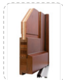
Softline 68 door profile