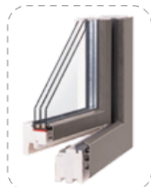
Gemini Classic section