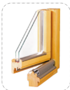
Classic LUX 68 section