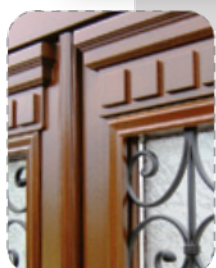
Hand done grid

We equip doors with the latest technology, among others: remote control opening, key-card system.