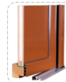
Alu wood door profile 78 section

The durability of Alu -Cad LUX joinery is the best, cost-saving choice.